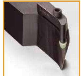
Hook Groove Holder