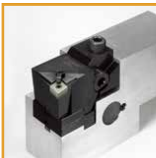
Quick Change Roll Tool