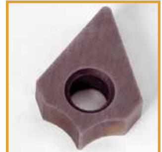
Special Form Insert