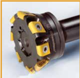
Long Shaft End Mill