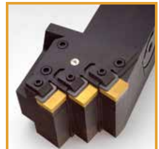
Roll Turning Tool