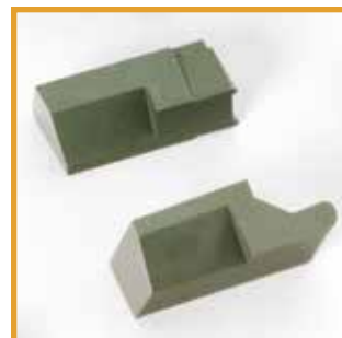
Race Track Groovers