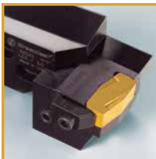
Bar Peeler Cartridge