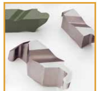
Powerlock® Grooving Inserts