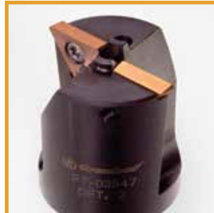
Pod Bore Head