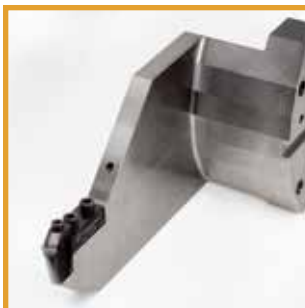
Heavy Metal Head