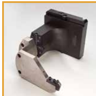
Aero Grooving Tools