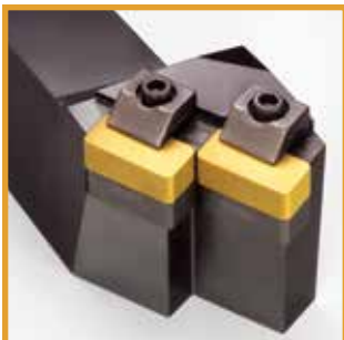
Roll Lathe Tool