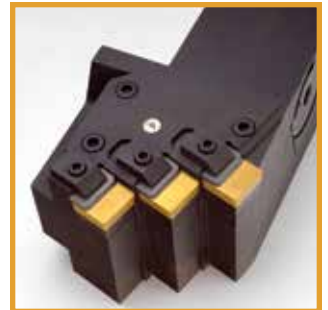
Roll Turning Tool