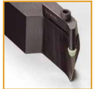
Hook Groove Holder