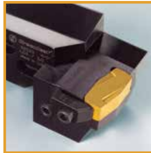
Bar Peeler Cartridge