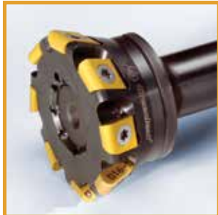
Long Shaft End Mill