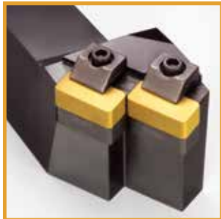
Roll Lathe Tool