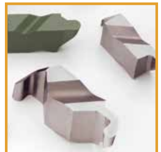
Powerlock® Grooving Inserts